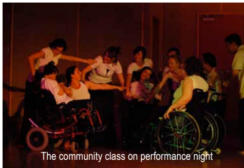
The community class on performance night